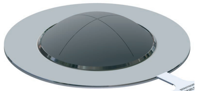
Detail rupture disc, type BK