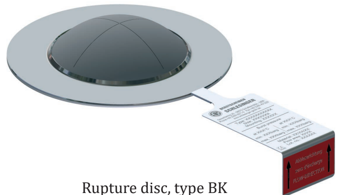
Rupture disc, type BK

Our rupture discs have an imprinted cross-pattern and therefore only require half the nominal diameter as an opening space. They can therefore be installed in very small spaces.